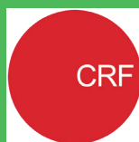
Centro Ricerche FIAT