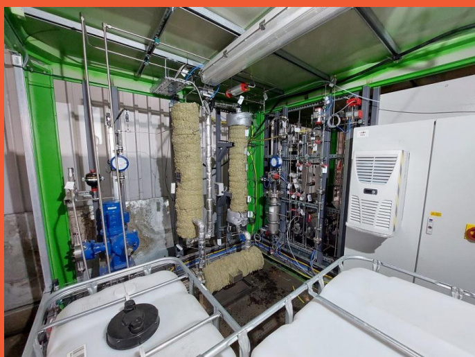
APR process demonstration unit

The plant is worldwide the first of its kind designed to demonstrate the use of this technology in a single, end-to-end process in an industrial environment. Based on the gained knowledge the basis for the planned industrial-scale implementation of the process is provided.